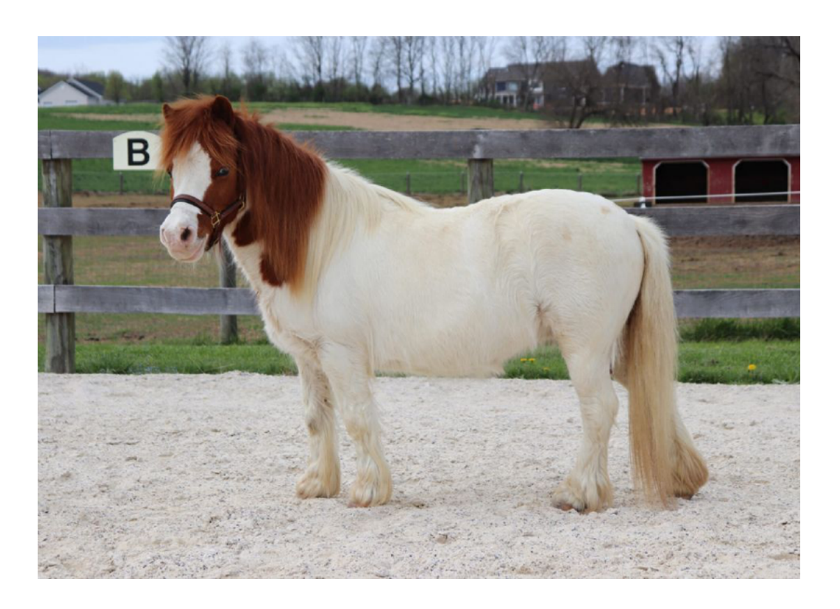
20-year-old Miniature Horse mare, 9.1hh

Cierra is cute as a button and would make a great addition to any farm. She is best friends with other minis, Bundt Cake and Acorn, but also enjoys being outside with a large pony gelding. Cierra will require a dry lot as she arrived to DEFHR overweight. Cierra is kind and easy going. With her big blaze and one blue eye, you will fall in love at first sight.